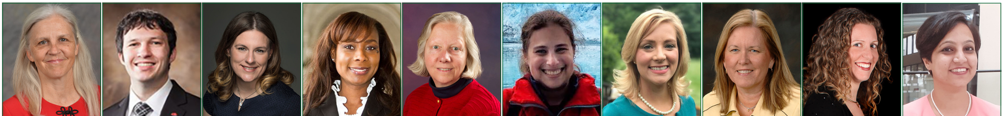
Current EWLSE Leaders